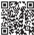
Smartphone app control (WL-Box1 video)